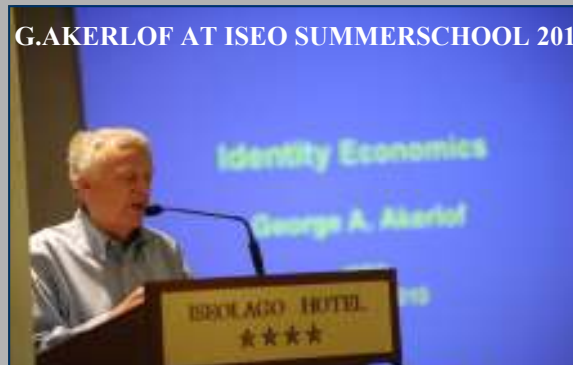
G.AKERLOF AT ISEO SUMMERSCHOOL 2010